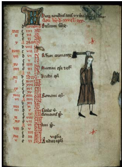
New York Public Library, MA 10: fol. 7r

This is a folio from a comparatively better known New York Public Library manuscript, the Landévennec or Harkness Gospels, made at Landévennec Abbey in Brittany in the late ninth or early tenth century, and decorated with canon tables and evangelist symbols.