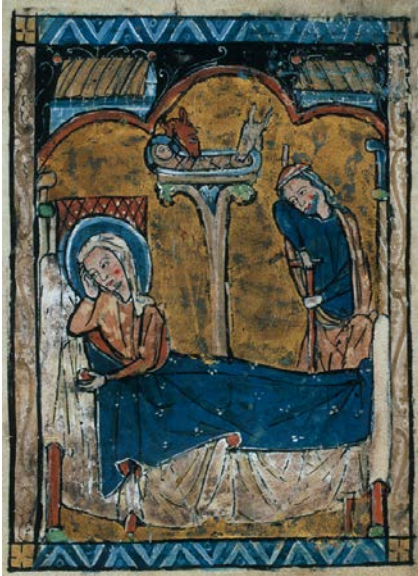
New York Public Library, MA 10: fol. 7r

Further manuscripts I have recently worked on include this thirteenth-century Psalter, possibly from Metz, which begins with an illustrated calendar (the page for November is shown above), followed by full-page prefatory miniatures (one, of the Nativity, is below).