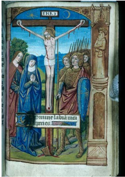
New York Public Library, MA 44: fol. 98r

Seymour De Ricci's Census of Manuscripts in the United States and Canada . A good number, but by no means all, were more fully described in the Splendor of the Word exhibition catalogue.