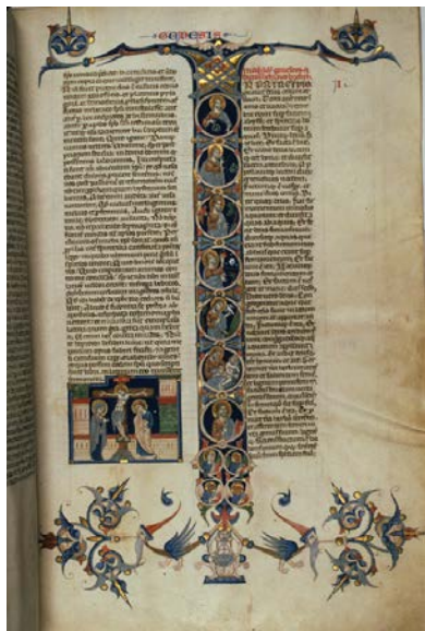
New York Public Library, MA 19: fol. 5r

I have also catalogued several Italian Bibles, such as this one from Bologna, made around the year 1265 (a folio with a Crucifixion miniature and Genesis initial is below).