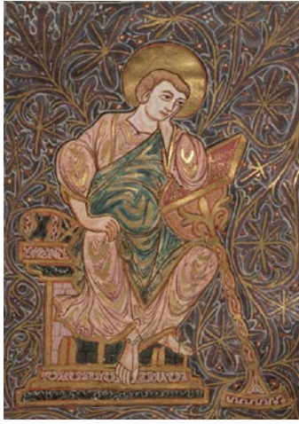
New York Public Library, MA 1: fol. 3v